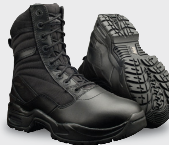
VIPER II 8" SZ CT