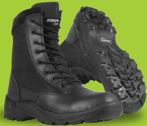
ULINDA SECURITY BOOT