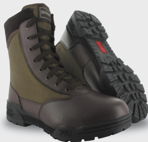
MAGNUM CLASSIC BROWN