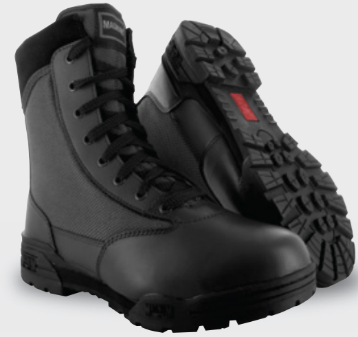
MAGNUM CLASSIC BLACK