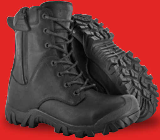
VULCAN PRO DSZ CT CP WPi