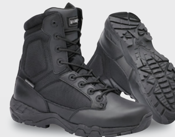
VIPER PRO 8" SZ CT WIDE